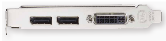
AMD FirePro™ W5000 Graphics Display Port

AMD FirePro™ professional graphics cards have been engineered to deliver innovation and reliability for a wide range of professional operating systems, including Microsoft® Windows® 7, Windows® XP, Windows Vista® and Linux®. The unified driver, which supports all AMD FirePro products, helps reduce the total cost of ownership by simplifying installation, deployment and maintenance.